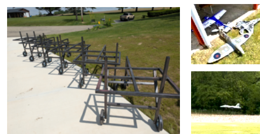
The new flight stands